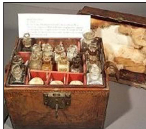
1870 Medicine Chest

impossible task in many respects. If this is our mission, then how do we accomplish these far reaching goals? Brookside Museum has bravely taken on this task. Outreach programs to schools present this history to almost 4,000 children throughout the county each year. One of the Museum's signature programs – Sheep to Shawl – has brought young students to the museum annually for 40 years. From archeology programs to living history